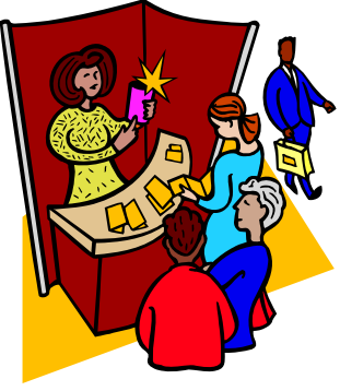
TABLE TOP (8 ft.) $50 (Includes one $25 registration)

robert.wegelin@sbcglobal.net or call 330-414-1498