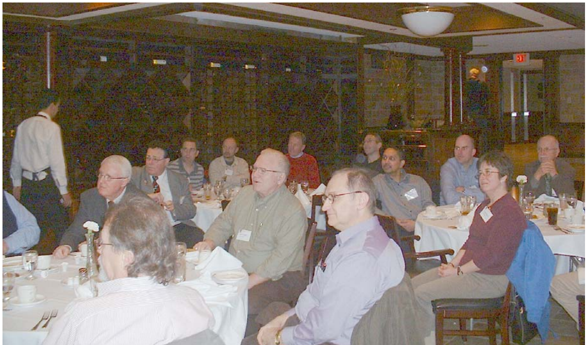
Meeting at Tangier Restaurant